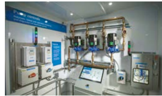
Pumping Valve demonstration