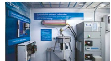
Aftermarket Universal NEMA AN19 starter kit and FlashGard™ MCC bucket demonstrations