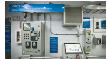
HVAC/R Heat plate and fire pull demonstrations